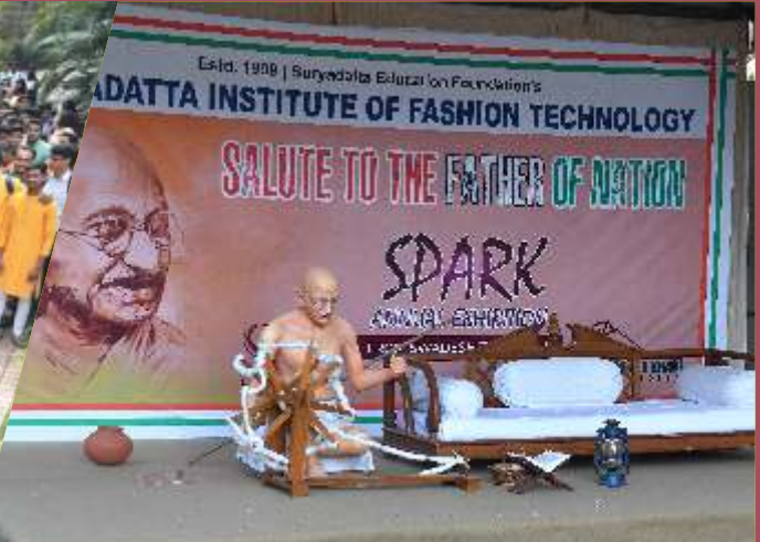
Celebrating 150th Birth Anniversary of Mahatma Gandhi