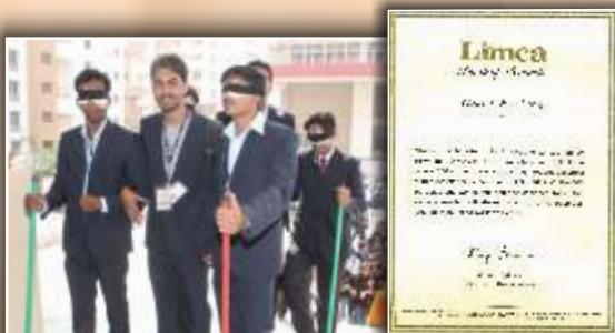
Unfold the Blindfold