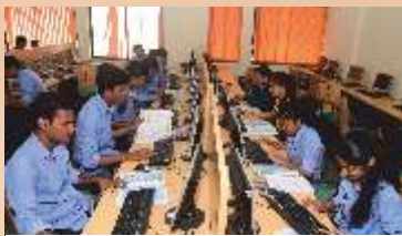
Fully Equipped Computer Labs