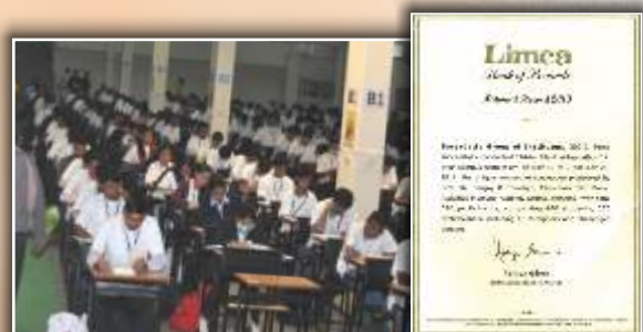
24-Hrs Silent WReadathon