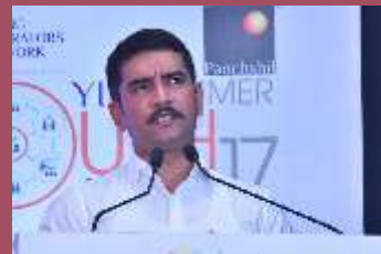
IPS Vishwas Nangre Patil