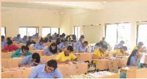
Modern, Smart Class Rooms

Suryadatta campus is strategically located at Bavdhan in Pune and is aesthetically designed to create a unique ambience. The Modern Infrastructure including Classrooms are equipped with audio visual aids, well equipped science laboratories, computer labs and exhaustive library make learning interesting for students. The outdoor & indoor sports facility, yoga & meditation hall, gymnasium, and cafeteria take care of the physical & mental health of students.