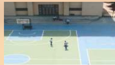
Outdoor & Indoor Sports Complex